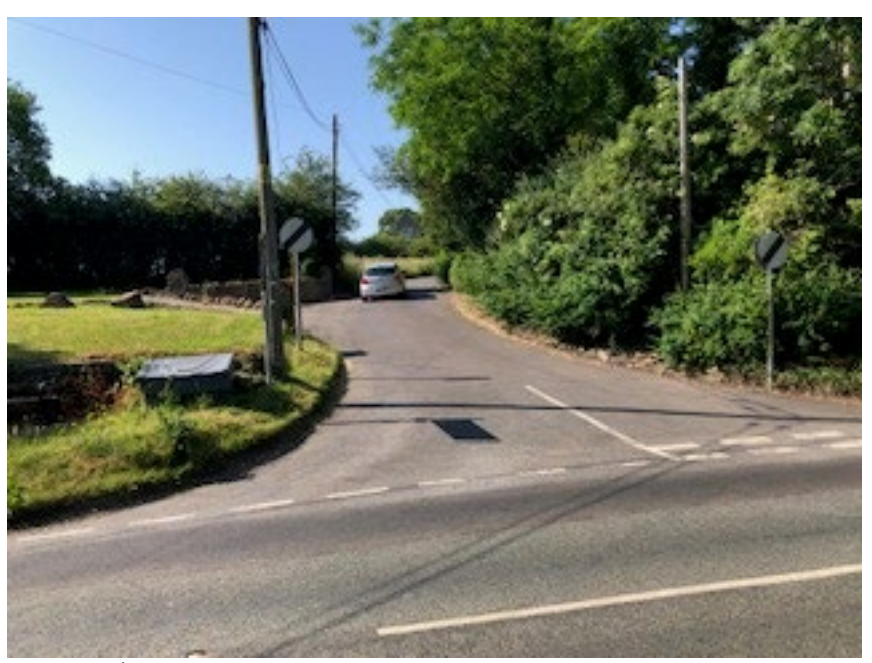
Fig 6. 1st 100 metres of TR is single track and all derestricted from this point