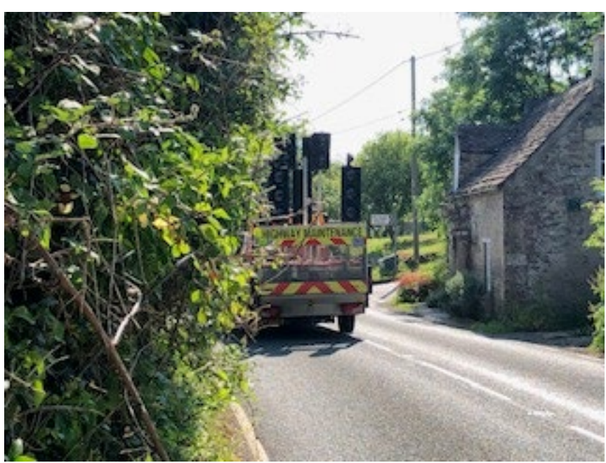
Fig 2. Approach to A366/TR junction from East has limited view until very close