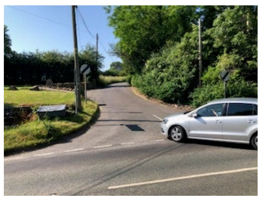
Fig 5. Most drivers cut the corner – numerous accidents happen here