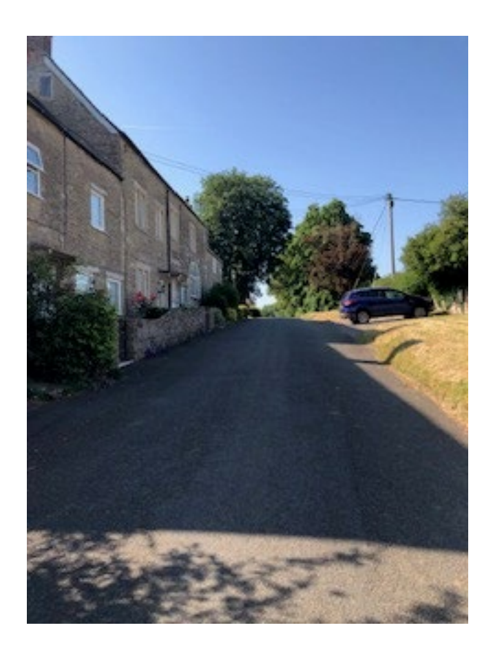
Fig 8. Showing cottages fronting directly onto Tellisford Road

In their consideration of BR's Planning application of 2016 for use as a corporate training facility the Planning Officers Report, paragraph 15 stated: