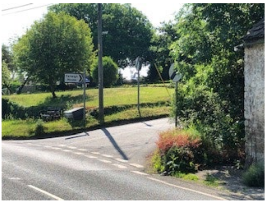
Fig 3. A366/TR junction