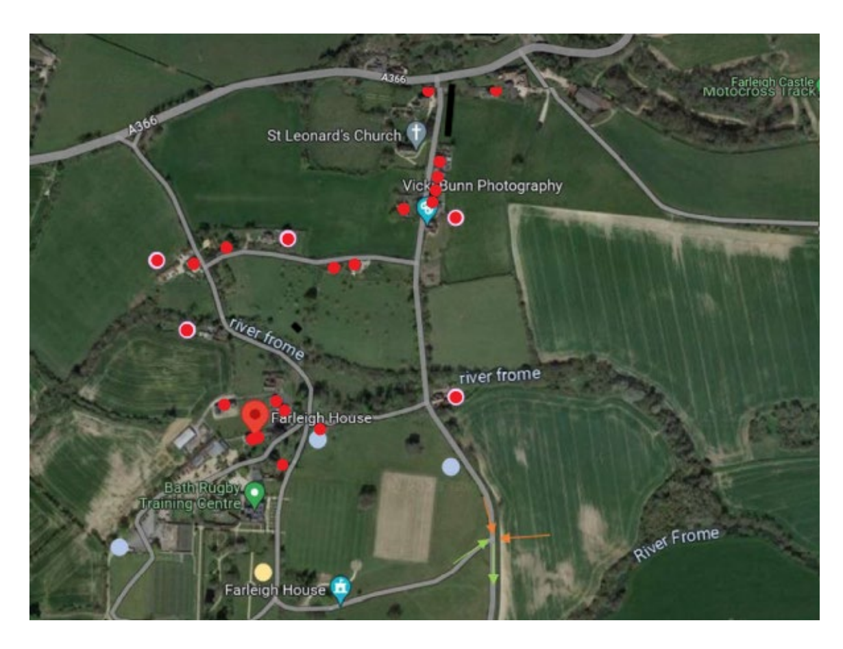
Fig 1. Map now includes the A366/Tellisford Road Junction (black line) and the correct number of neighbours properties affected (red dots) by increased traffic movements etc