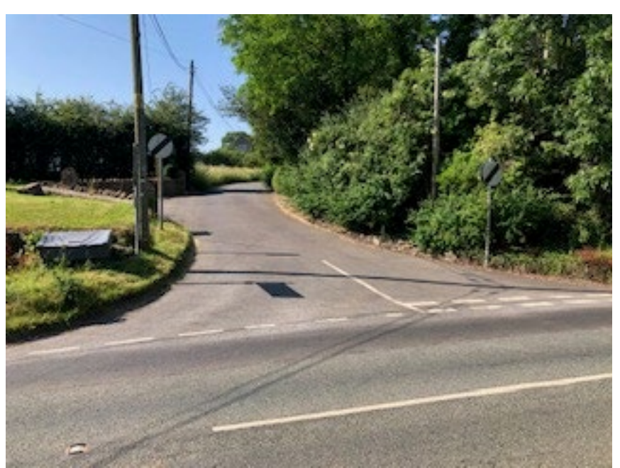
Fig 4. A366/TR junction – driveway immediately on L then narrows